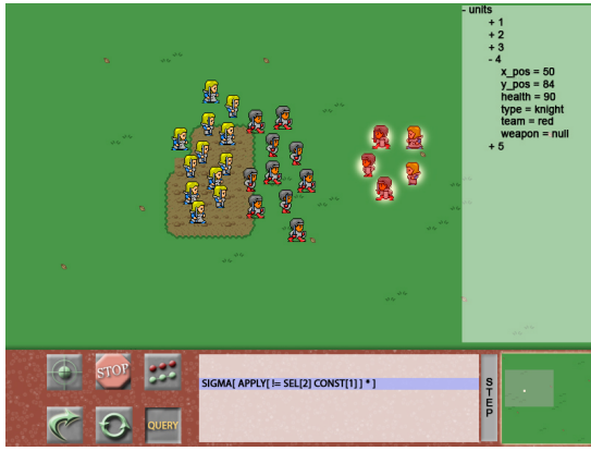
Figure 4: The query visualization tool

me.move_x , then the values would be combined using the appropriate aggregate ( AVG in this case).