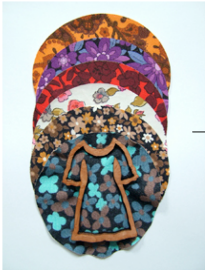
Close up of 'Dress' brooch (Figure 3) made from wood veneers, silver, Gillian's dress fabrics and RFID ampoules.

Relationships are deeply implicated in self and the scope for design of digital technologies to help us reminisce, construct self, reflect on self and nurture our relationships has a deeper relevance than often credited in HCI. The orientation of self toward relationship and change in this project has a strange effect on the temporal aspects of inquiry and design related to reminiscence. What starts as inward and backward-looking can easily become outward and forward-looking. The pieces became about something that could hold manifest quirks of their natures and aspects of their personalities for their families to enjoy as time moves on; a multi-layered representation of