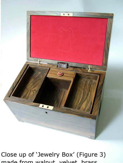
Close up of 'Jewelry Box' (Figure 3) made from walnut, velvet, brass, leather, RFID reader, computer, microphone, speakers, and electronic components. By placing one of the pieces of dress fabrics onto the velvet interior lid of the box and pushing the button sound can be recorded. On lifting the dress fabric away the recording will stop. On re-placing the dress material on the velvet lid interior the recorded sound associated to that piece of dress fabric will be played.