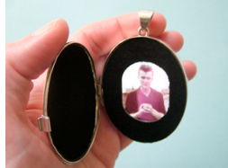
Figure 2. 'Locket' (in silver) with digital display.

memories. It is a silver locket housing a small digital screen. Each time the locket is opened a different image from her life is displayed.