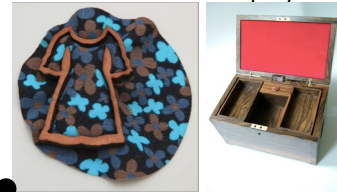
Figure 3. 'Dress Brooch' and 'Jewelry Box' which can record and play sound.