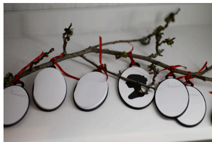
Close up of 'Self Tree' probe showing more detail of the space available on the reverse of the oval disks (a concertina of paper) on which to write a response.