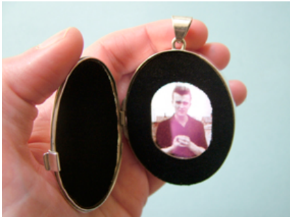
Close up of 'Locket' (Figure 2) digital jewelry piece made from silver, velvet, digital screen, memory card, rechargeable battery, electronic components. Once opened an image is displayed. The piece can be customized to show one image or a succession of images on repeated opening of the locket.

'Locket' (Figure 2) is a piece to hold many of Gillian's