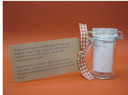
Close up of 'Preserves' probe, comprising a small (7cm high) glass jar, label and package label providing instructions.

My (Jayne) way of opening up a dialogue around personal meanings with participants is through the use of probe methods [3]. I carefully design probes that pose questions, supportive of inner identity and what is meaningful to someone. Vitally the probe process enables parties to develop a relationship of trust. This mode of inquiry can be gentle, multi-angled and reciprocal. It becomes a dialogical encounter in which designers and participants give to each other and meet in the middle. My set of ten probes within this project related strongly to elements of remembering, focusing on things that held strong feelings for Gillian and her family, whilst opening up a dialogue to learn about Gillian's personality.