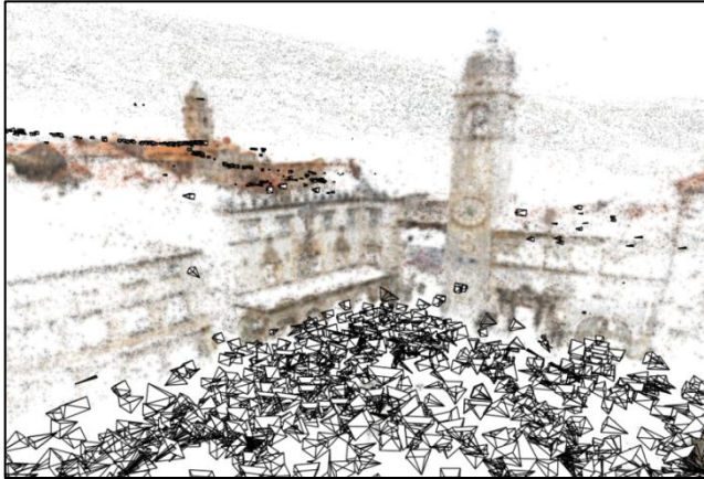
SfM point clouds from Internet photos