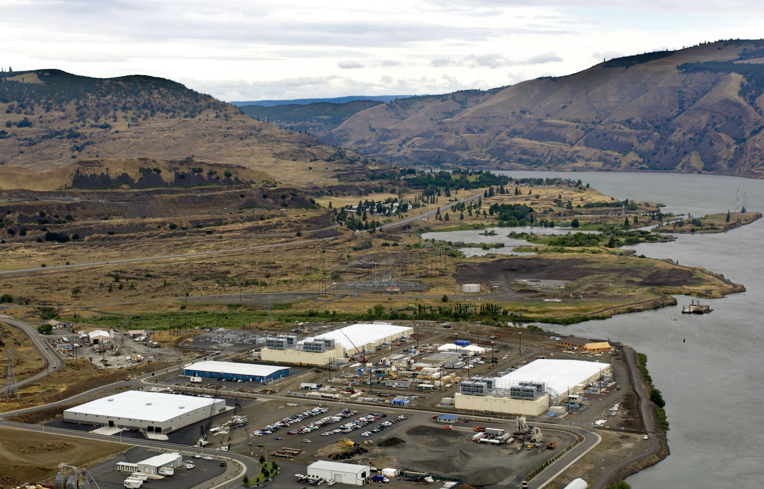
WAREHOUSE-SIZE COMPUTERS: Google has built a sprawling data center on the banks of the Columbia River, in The Dalles, Ore. The site, with two server-packed buildings and space for a third, houses tens of thousands of computers—the exact number is a closely guarded secret. Microsoft, Yahoo, and Amazon are also building data centers in the region, enticed by its readily available fiber-optic connectivity and cheap electricity.

while the computers people own will provide little more than the interface to connect to the increasingly capable Internet.