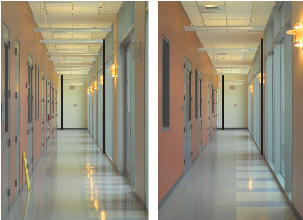
Figure 1: Two photos of a hallway. The black bars are one-fourth and one-half of the total picture height.

You can assume this camera does not produce oblique views.