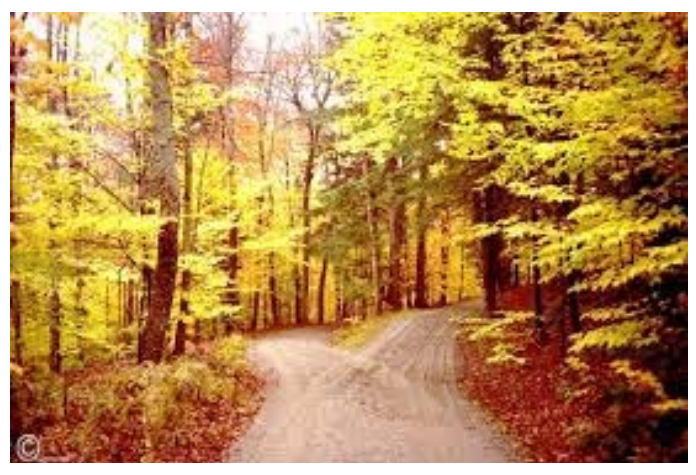
"Two roads diverged in a yellow wood, And sorry I could not travel both And be one traveler, long I stood..."