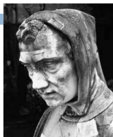
Fibonacci (Leonardo Pisano) 1170-1240?