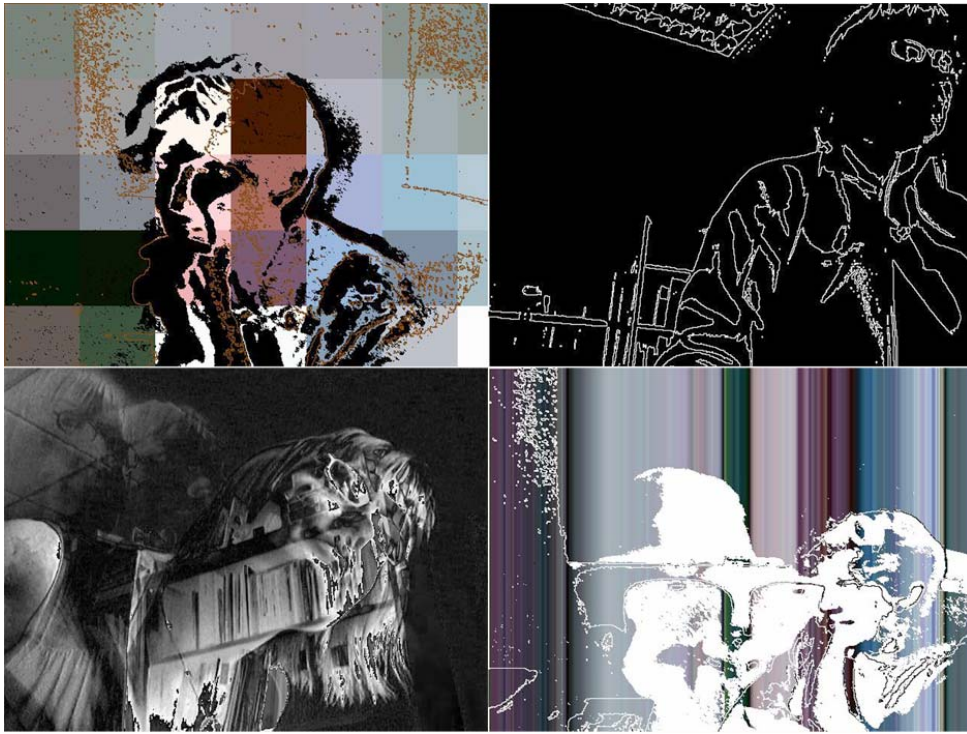
Figure 3: Example distortions produced by Affector.