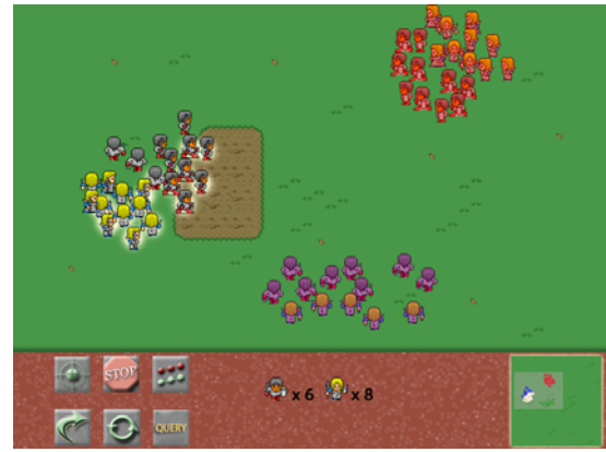
Figure 3: The Knights and Archers Game

The value of this command attribute is determined by the player's interaction with the game. While playing the game, a player uses a bounding box to select the units to control, and then issues the command by either pressing a button or