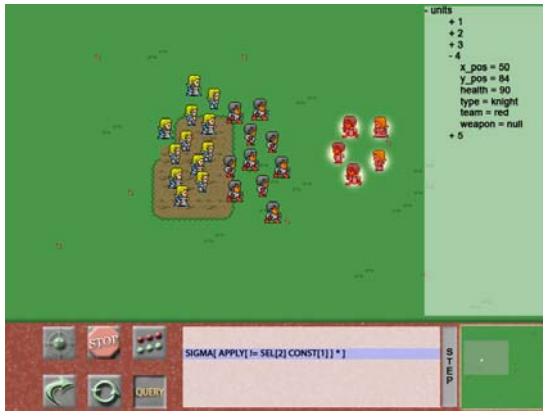
Figure 4: The query visualization tool

me.move_x , then the values would be combined using the appropriate aggregate ( AVG in this case).