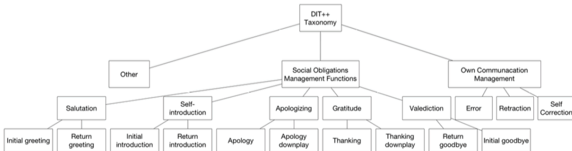
(b) Adapted DIT++ taxonomy (2).