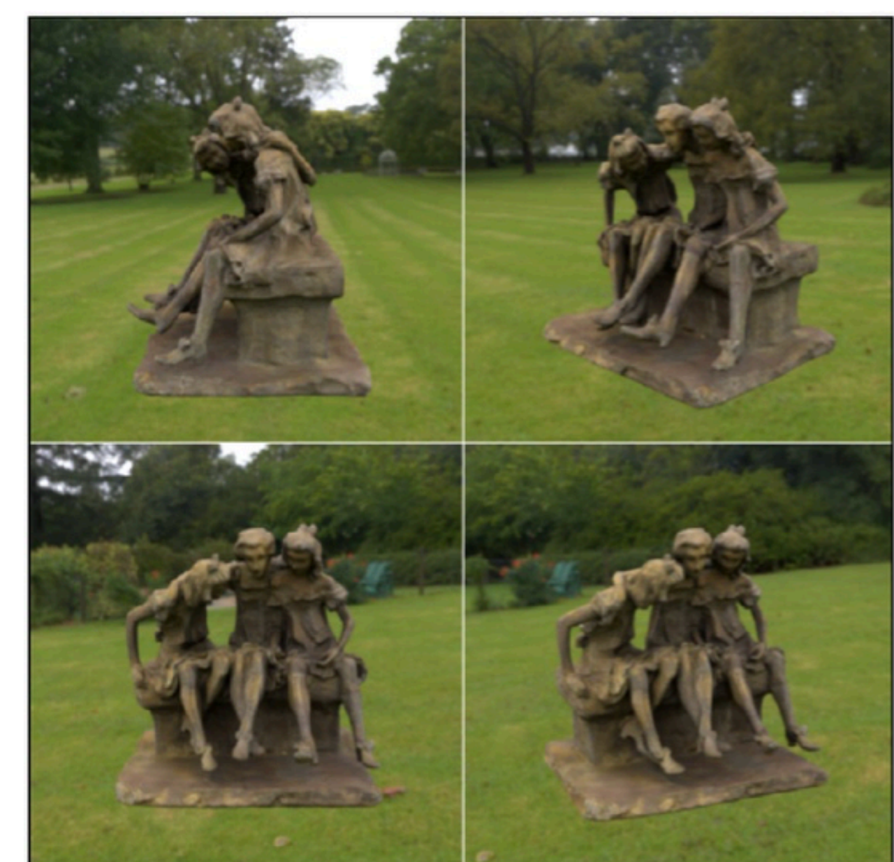
(a) Reference images