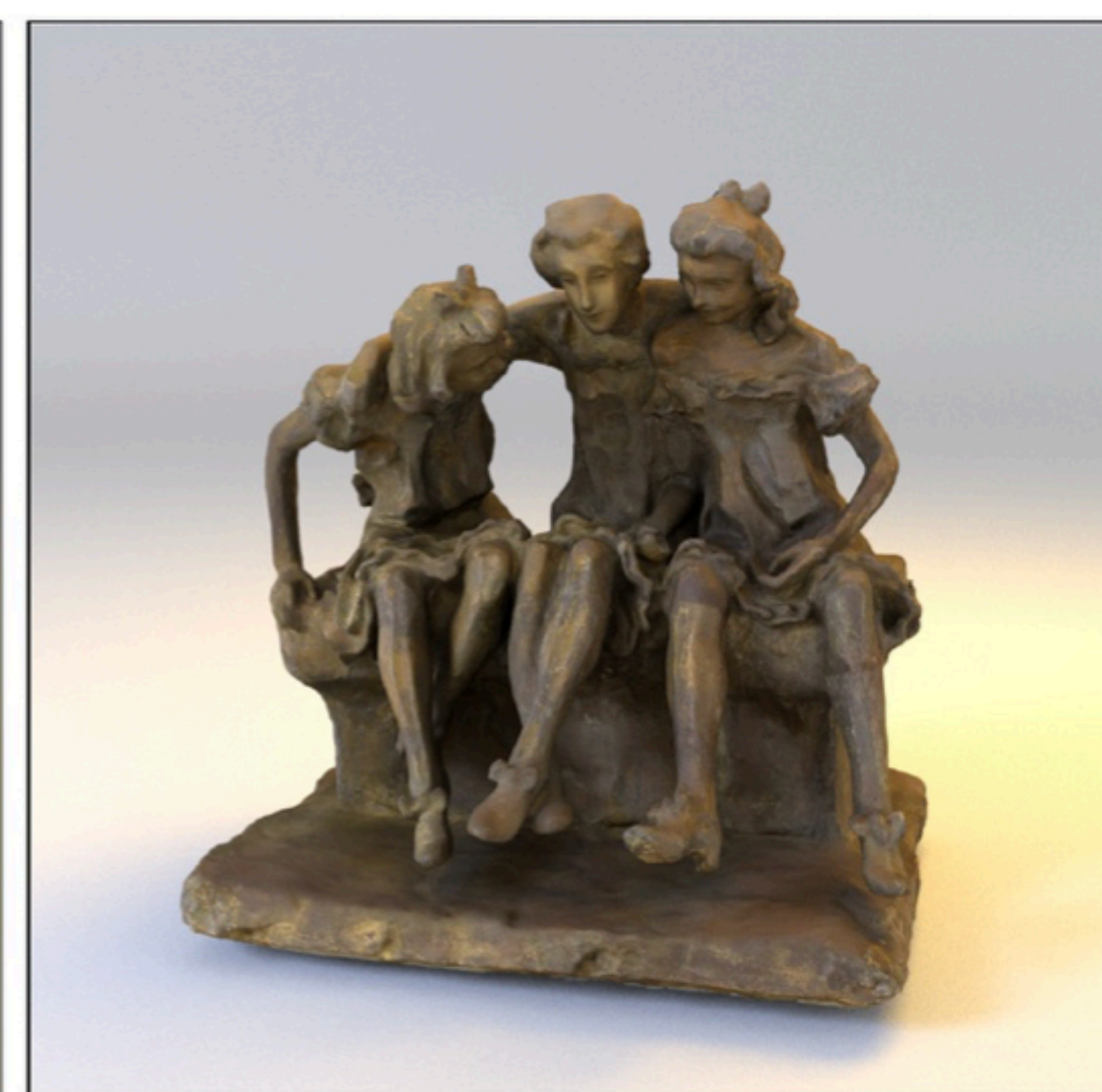
(d) Ground truth