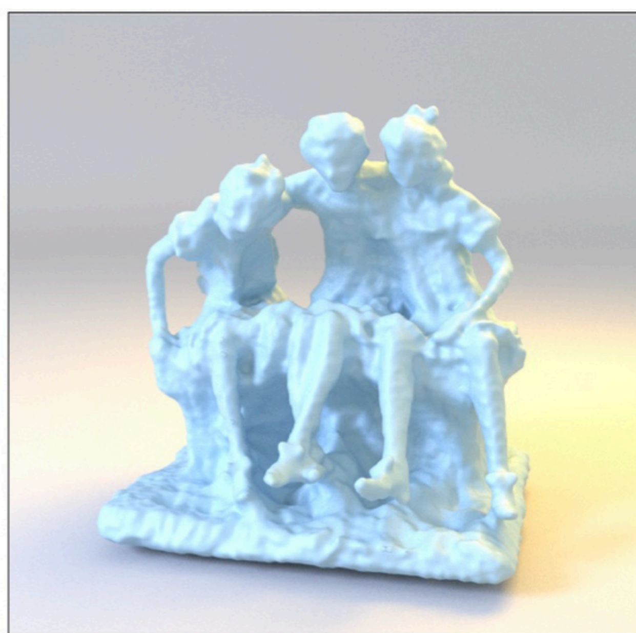
(b) Optimized surface